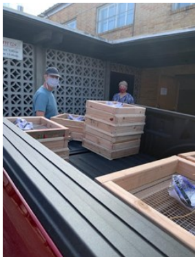
Delivery at Spokane Valley UMC

Unfortunately, we cannot assist folks with the sifting due to our social distancing and other limitations. Being present and a good listener is so important in the recovery process. Let's keep our brothers and sisters who are caught up in this disaster in our prayers.