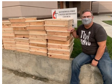
The work product before shipping

Unfortunately, we cannot assist folks with the sifting due to our social distancing and other limitations. Being present and a good listener is so important in the recovery process. Let's keep our brothers and sisters who are caught up in this disaster in our prayers.