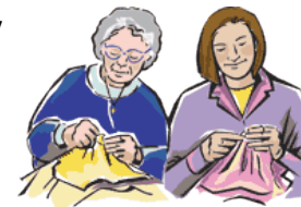
Prayer Shawl Ministry